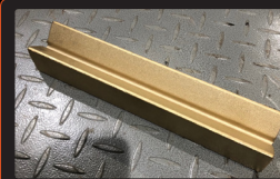
Wear Strip Part no: T299164