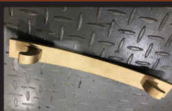
Wear Strip Part no: T163748