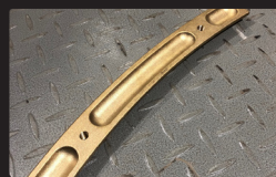
Plate Part no: T184082