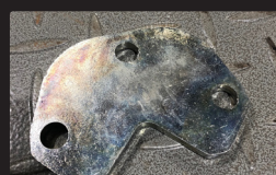
Plate - Part no: T221053