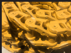
Refurbished D10 Track Chains

Prices are available only to On Track Subscribers and while current stocks last.