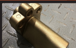
Wear Strip Part no: T239757

Check out our new products to suit John Deere graders!