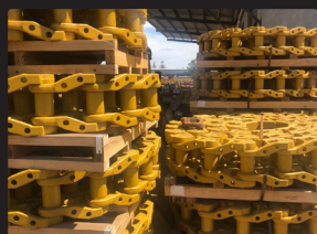
New KBJ D10 Track Chains